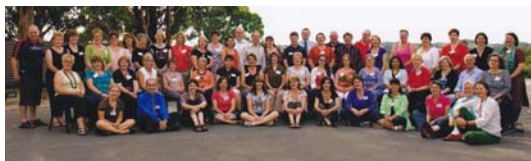
2010 Retreat Graduates.

If you would like to be kept in the loop for developments for the 2011 event, register your interest by visiting the retreat website at www.vpmretreat.com.au